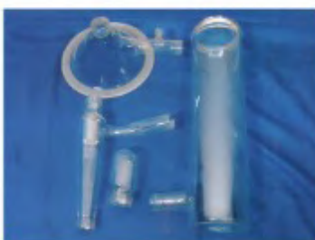
LAB SPRAY DRYER ASSEMBLY