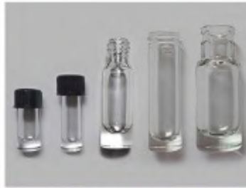
U TUBE VIALS