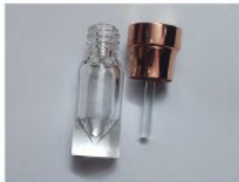
HIGH RECOVERY V VIALS