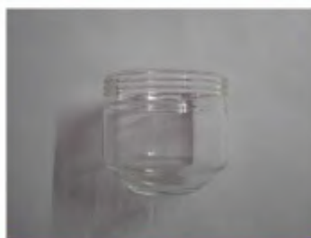
SPRAY DRYER POWDER RECEIVER VESSEL